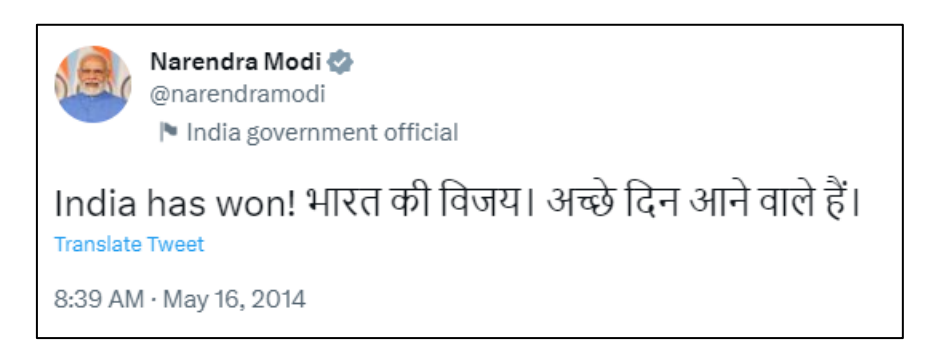
Figure 4: Narendra Modi's post-election tweet, 2014

An example of this merger that almost speaks for itself is Modi's post on Twitter after his party won the national election in 2014.