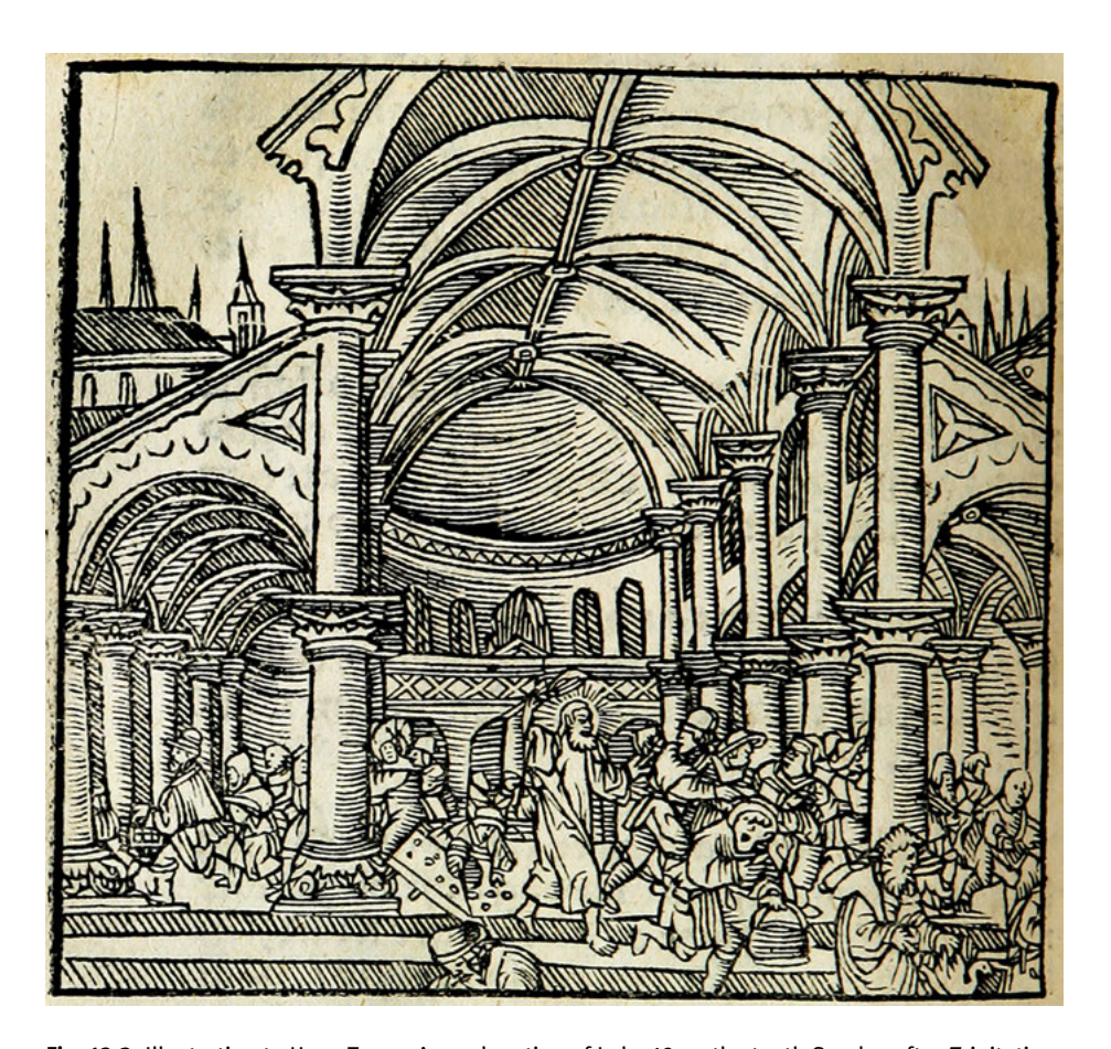
Fig. 12.3: Illustration to Hans Tausen's explanation of Luke 19 on the tenth Sunday after Trinitatis (Jesus in the Temple, according to Luke 19). From Hans Tausen, Sommerdelen aff Postillen berid aff M. Hans Taussen/Predickere ÿ Kiøbenhaffn (1539), fol. CXCIIv.

in their [the Jews'] place."<sup>36</sup> The loss of the Jews' status as "chosen" was evident both regarding the holy city, and the holy people. The city was destroyed, and the people were forced into slavery. It was a reversed position which according to Tausen had continued until the present time.<sup>37</sup>