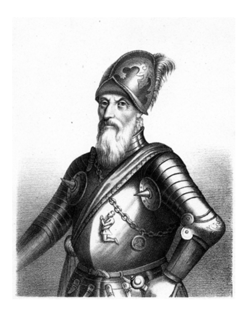
Fig. 1.2: Johan Rantzau (1492–1565). Engraving from Trap's collection, 1867.

educational reasons.<sup>1</sup> His journey ranged through England, Spain, Germany, Italy, Greece, Asia, and Syria, before he arrived at Jerusalem during wintertime. In the Holy Land, Rantzau and the other pilgrims were probably escorted by the Franciscans who had resided at Mount Zion in Jerusalem since the fourteenth century.<sup>2</sup> The Muslim Mamluks had governed the city since the middle of the thirteenth century, and by their permission Christian pilgrims were allowed entrance to the shrines.<sup>3</sup>