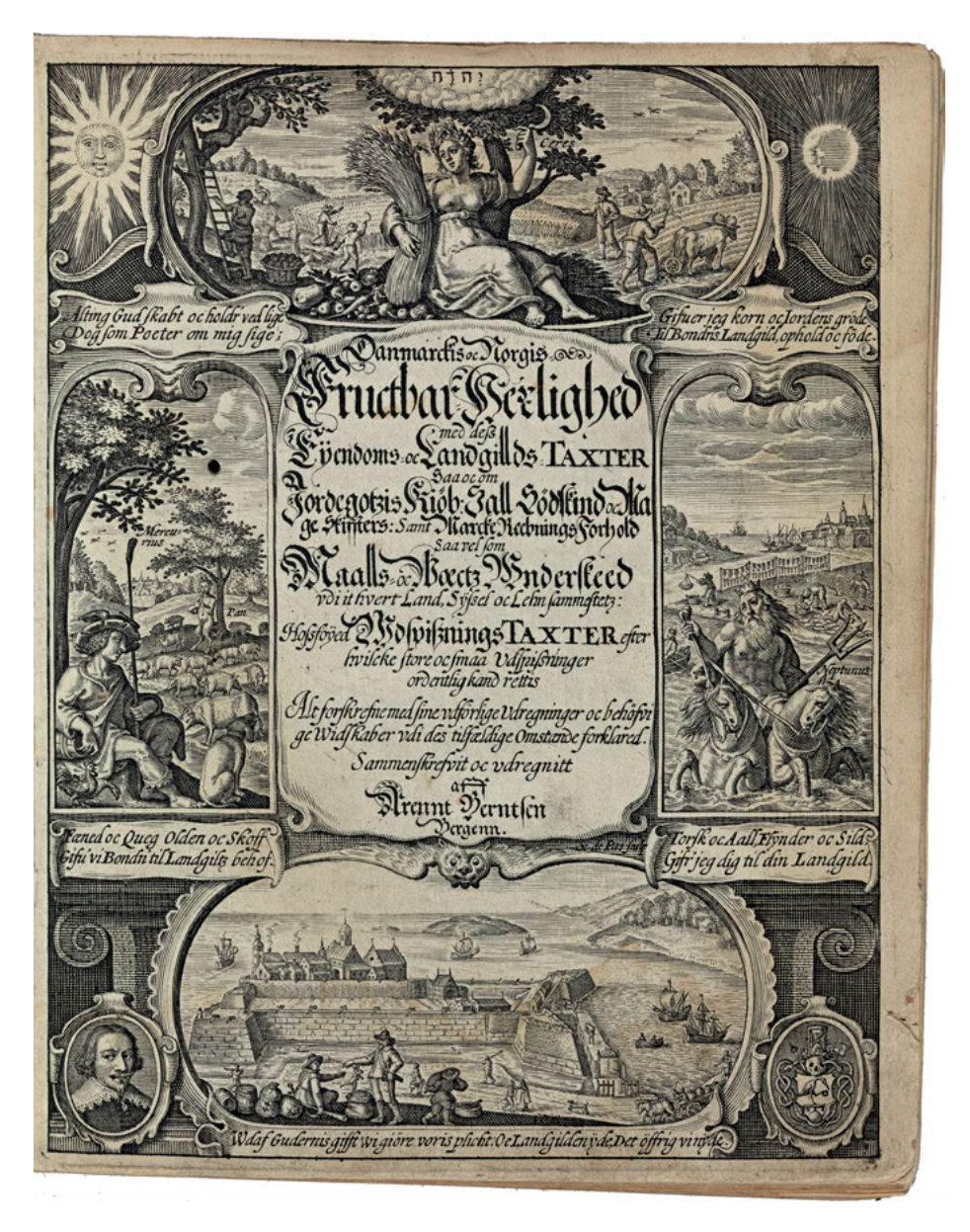
Fig. 1.6: Title page of Arent Berntsen, Danmarckis oc Norgis Fructbar Herlighed [The fruitful delights of Denmark and Norway], Copenhagen 1650-55.