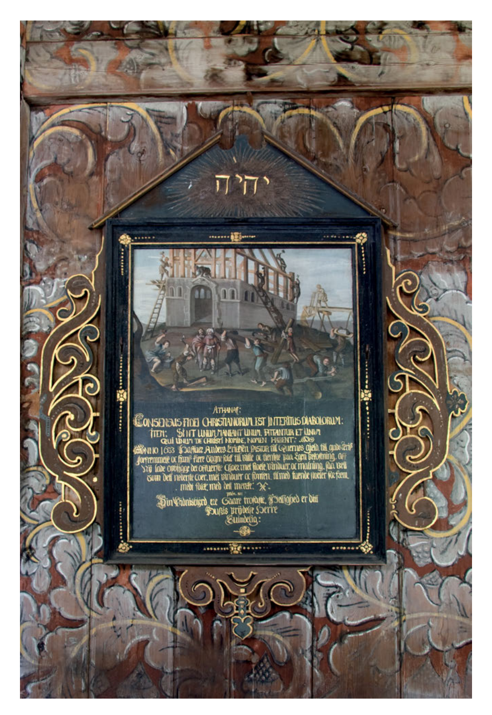
Fig. 1.7: Panel commemorating the rebuilding of Kvernes Church, Norway, 1633, evoking the building of the Temple of Solomon.