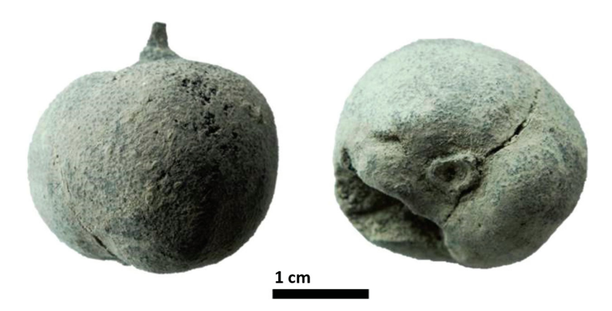
Figure 2. A carbonized wild pear (Pyrus pyraster) from SU1448, dated to the Roman period at Bribirska glavica.

other sites; instead, they were dated relatively, using parallels of associated material.