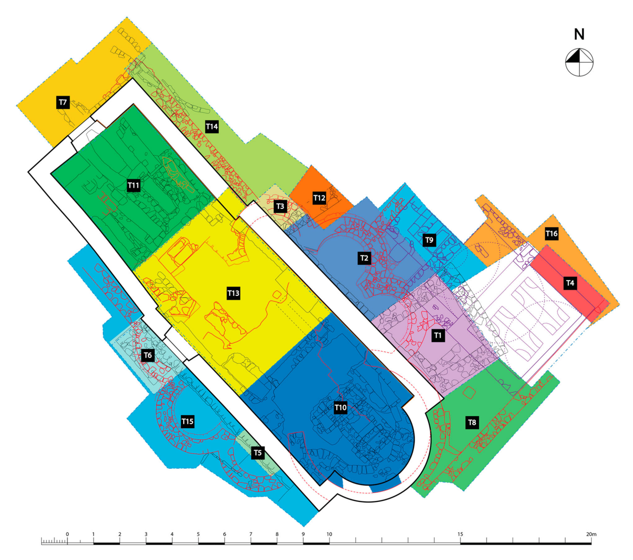
Figure 5. Plan of the trenches excavated between 2014 and 2016 at Bribirska glavica (V. Ghica).