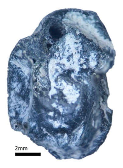
Figure 3. A carbonized raisin ( Vitis vinifera ) from SU1448, dated to the Roman period at Bribirska glavica.

If we look at the plant remains per trench (Figures 4, 5), trenches T1, T23, and T24 have a relatively high number of identified items. However, these still equate to low densities, with T24 having the highest at 1.16 seeds per liter. T24 also has a low number of unidentified cereal fragments and unidentified plant remains and showed a much higher level of preservation than the other trenches. In contrast, T1, sample SU1020 had ca. 250 unidentified plant fragments and generally poor preservation. Across these trenches, the proportion of cereals (excluding cereal indet.), pulses, fruit/nuts, and wild/weed seed remains are relatively similar. At the other end of the scale, trenches T8, T15, T18, and T22 all have less than 10 identified plant items and densities of less than 0.6 grains per liter.