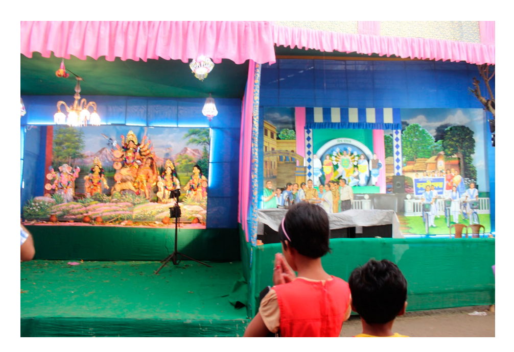
Image 5. A young girl doing namaskar or showing devotion to the image of goddess Durga on the left while another little girl looks at the installation of the minister as the goddess. Both icons are of the same scale and placed in the centre of the pandal or temporary temple-like area, Nadia, 2017.