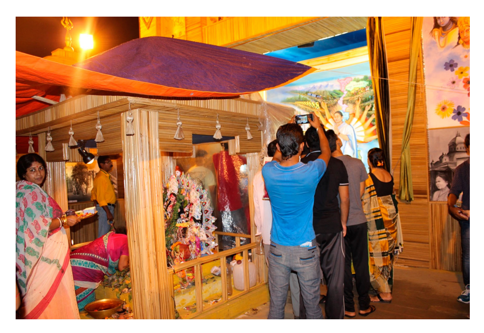
Image 4. People looking at the image of Banerjee and lined up in front of a clay image of Durga in the Prantik Club pandal or temporary temple-like structure, Prantik Club, 2016.