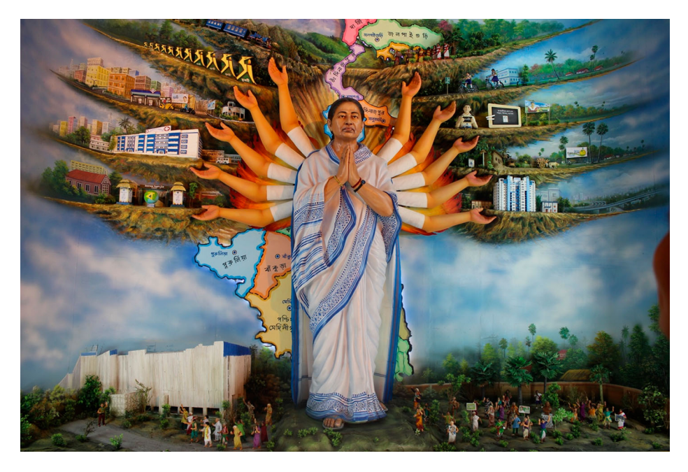
Image 2. A ten-armed Mamata Banerjee holding a representation of different developmental projects in West Bengal, Prantik Club, 2016.