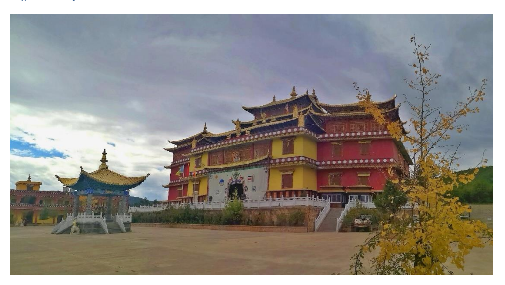
Figure 4 New addition.