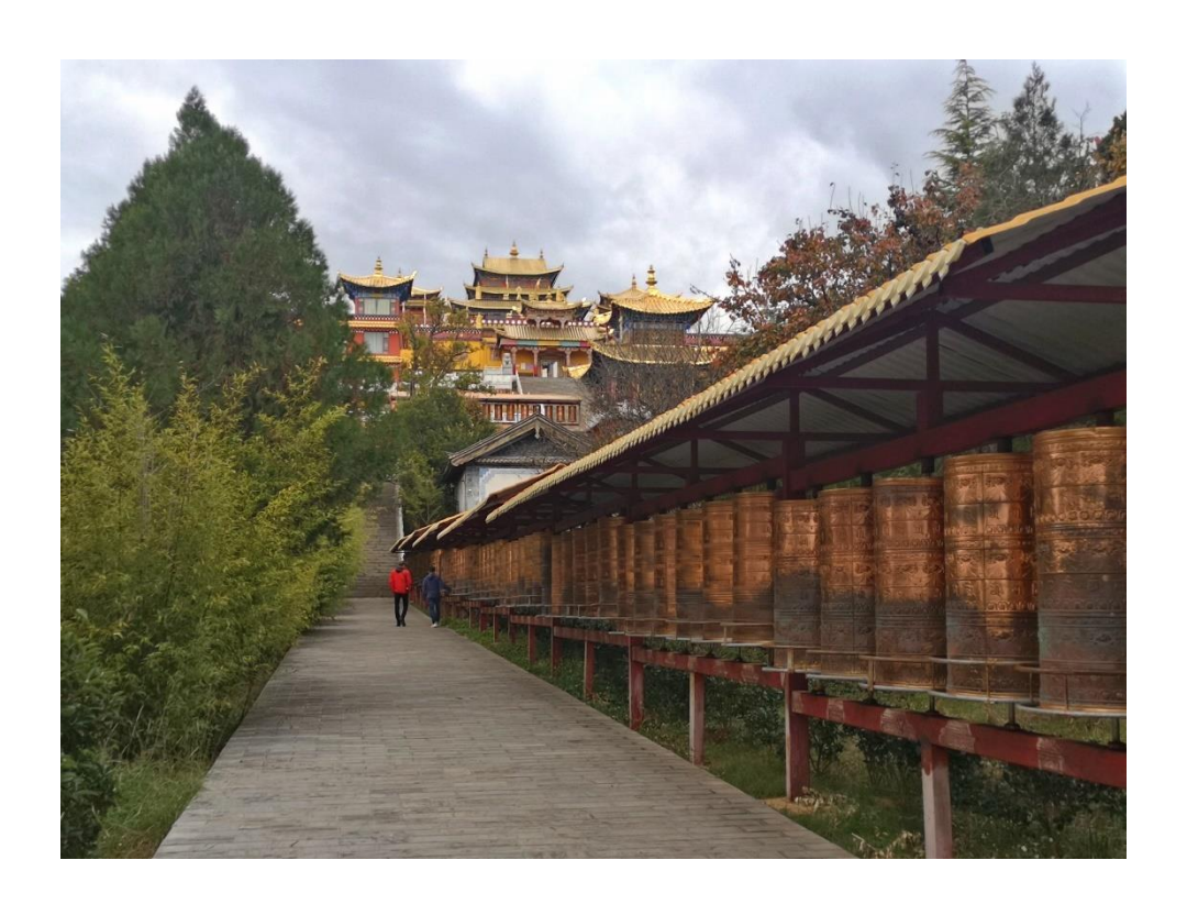
Figure 3 Prayer wheels.