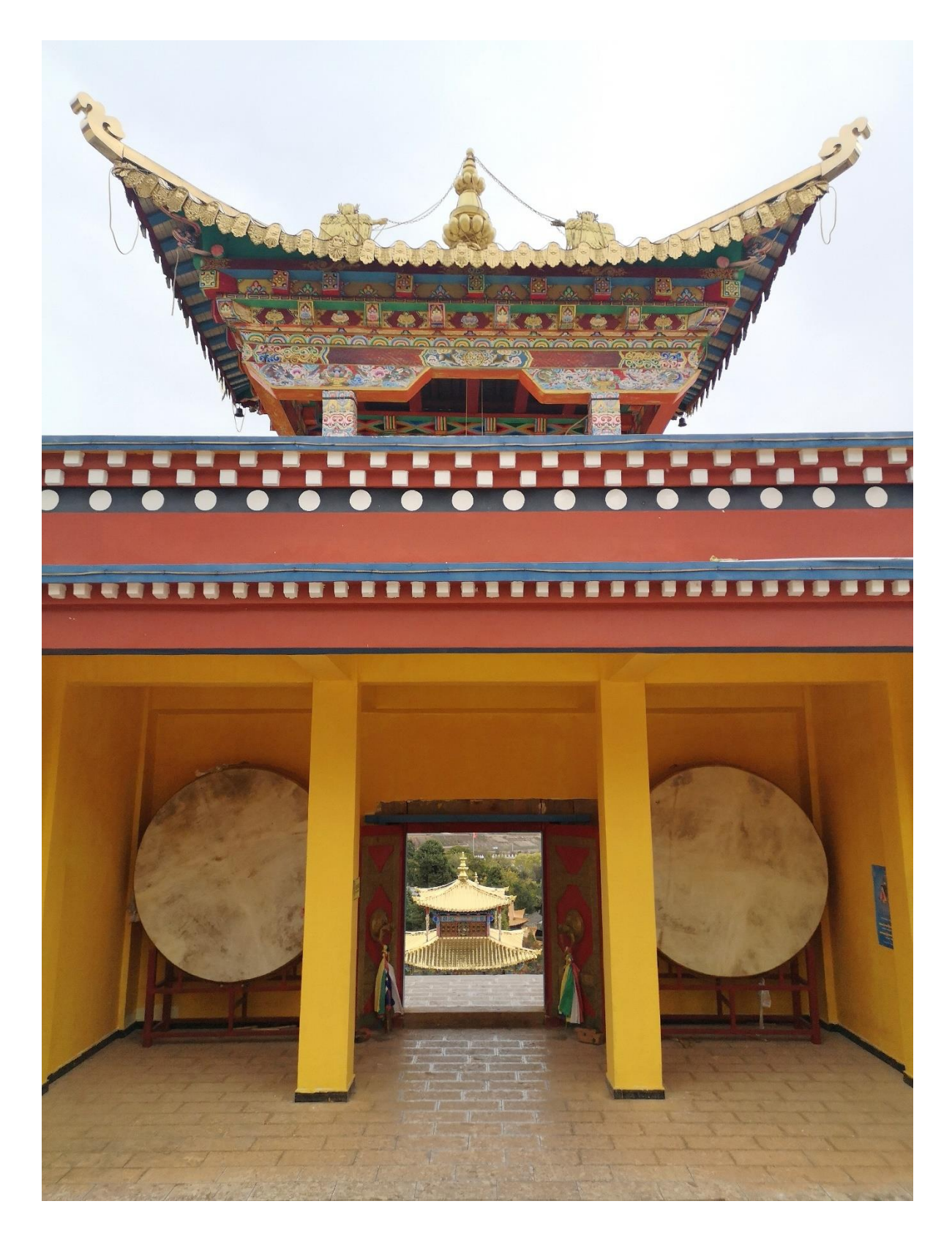
Figure 2 Entrance to the new addition.