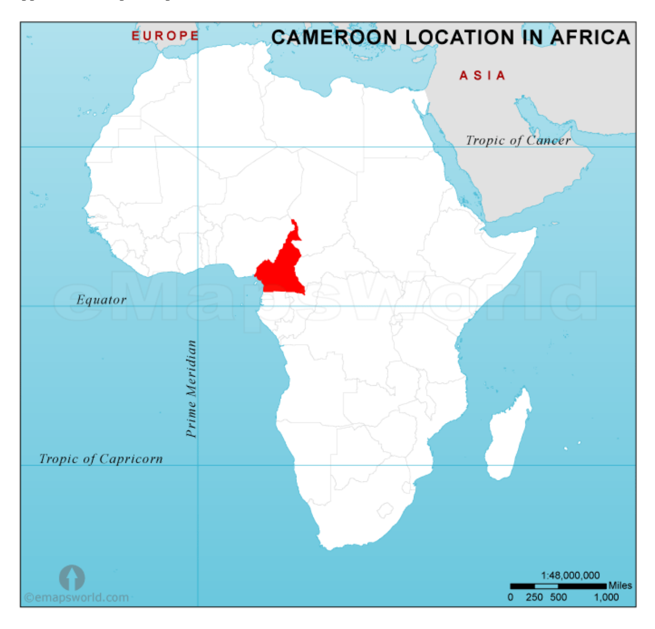
Appendix C: Maps and pictures