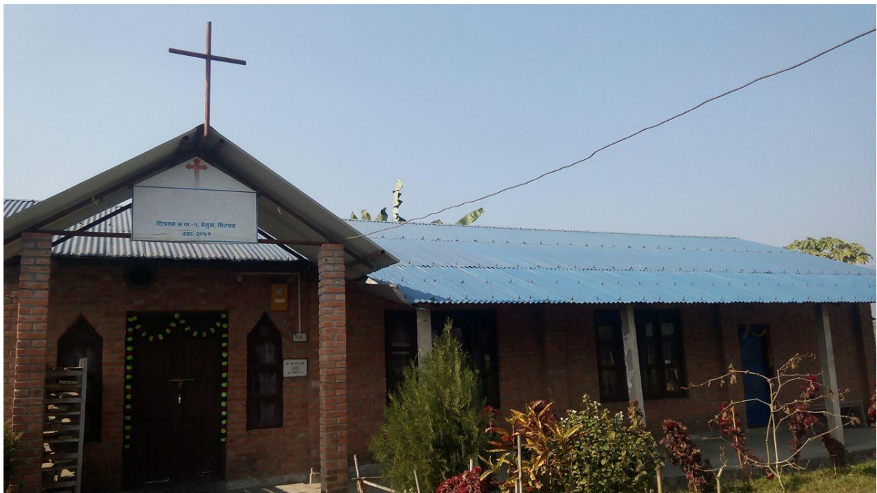
An image of a local church in the community

After my research study I have found that Christian members in the society were happy after having a church in the community. They informed me that they have been getting economic help from the Christian organizations from abroad but also from the members of the local Church. After studying the views of Christian members in the society, I have also tried to explore the views of Hindus about the Churches in the society. Off course like other societies, Nepalese societies also have been multicultural and they are accepting the existence of churches in the society but the churches have been tolerating various criticisms by the Hindu society.