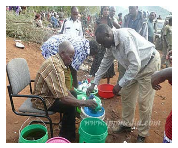
Figure 2: Picture shows Pastor who is a Medicine man

This picture shows the retired pastor, who sited on the chair, distributes his medicine to the sick people. One cup of medicine water distributes to each sick person. As you can see, the dark water in the