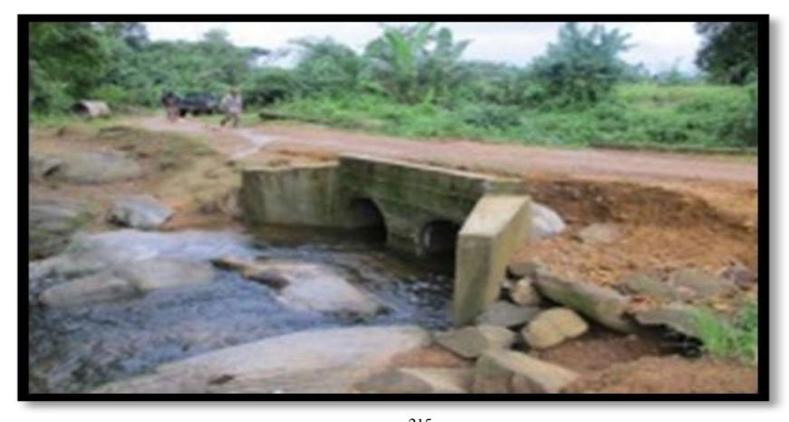
Klens Town Bridge (under construction)<sup>215</sup>

The entire populace of the region have lined up behind The United Methodist Church with one great united force to finish this project.