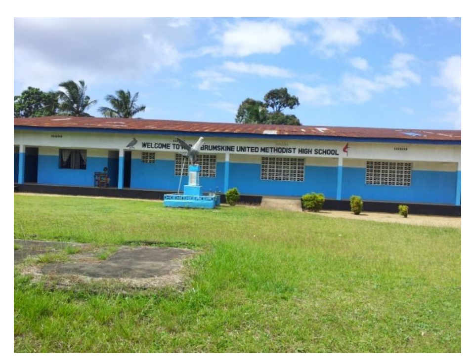
Figure 2: The W.P.L. Brumskine United Methodist High School, Old Field Buchanan City, Grand Bassa District, LAC/UMC, taken August 10, 2012

In the 2000s, the vocational programs at the school attracted most of the students as the programs were a regular part of the curriculum instead of being paid for by parents. I was also registered at the school, besides the W.P.L. Brumskine United Methodist High School that I attended.