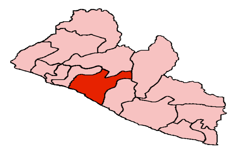
The map of Liberia showing Grand Bassa County highlighted February 28, 2013.<sup>4</sup>

Grand Bassa County is one of the three original counties of Liberia and one of the original three districts of the Liberia Annual Conference of the United Methodist Church along with Monrovia and St. Paul River Districts.