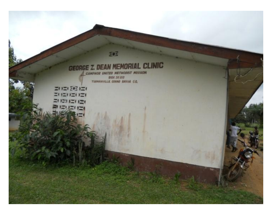
Figure 3: George Z. Dean Memorial United Methodist Clinic at the Camphor United Methodist Mission. This is first clinic built by the United Methodist Church in Grand Bassa County, Liberia.