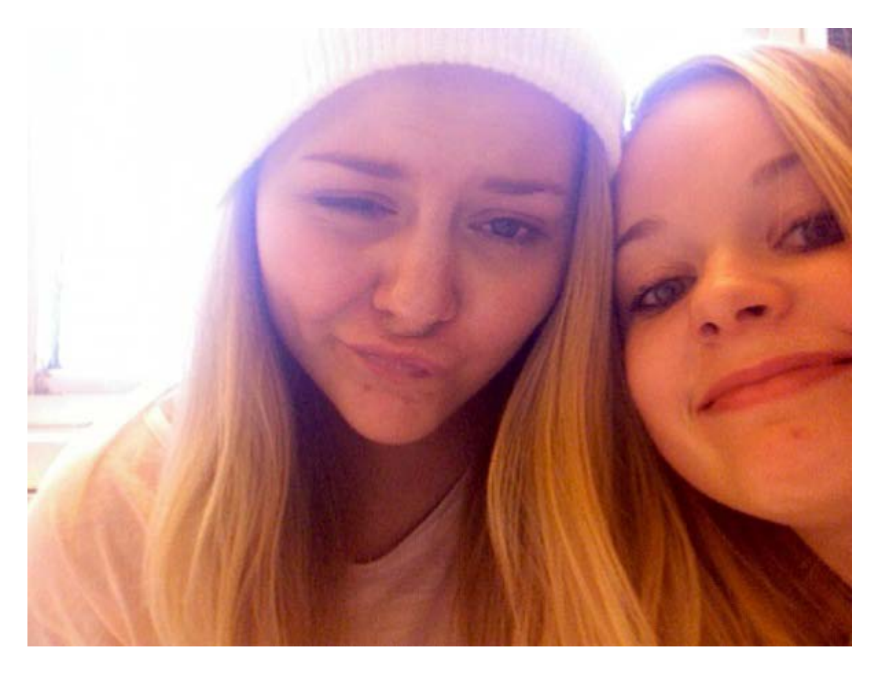
Sykt fotogent bilde tatt med webkamera på skolen. (Silje's blog)