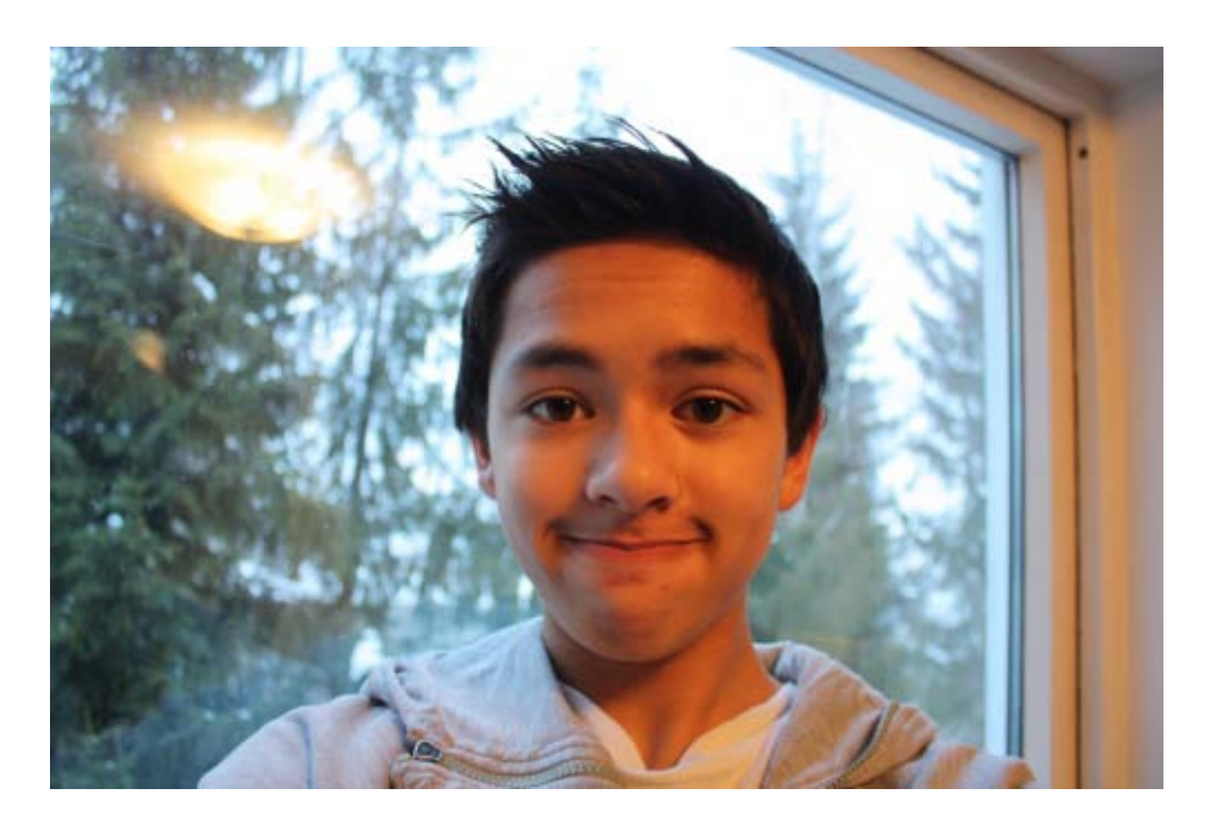
lol<sup>17</sup> (Andreas' blog)