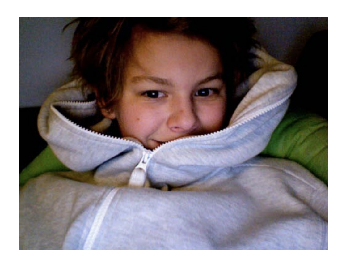
Mmm... Mr. Handsome himself. Edited and retouched enough. Hmpf.