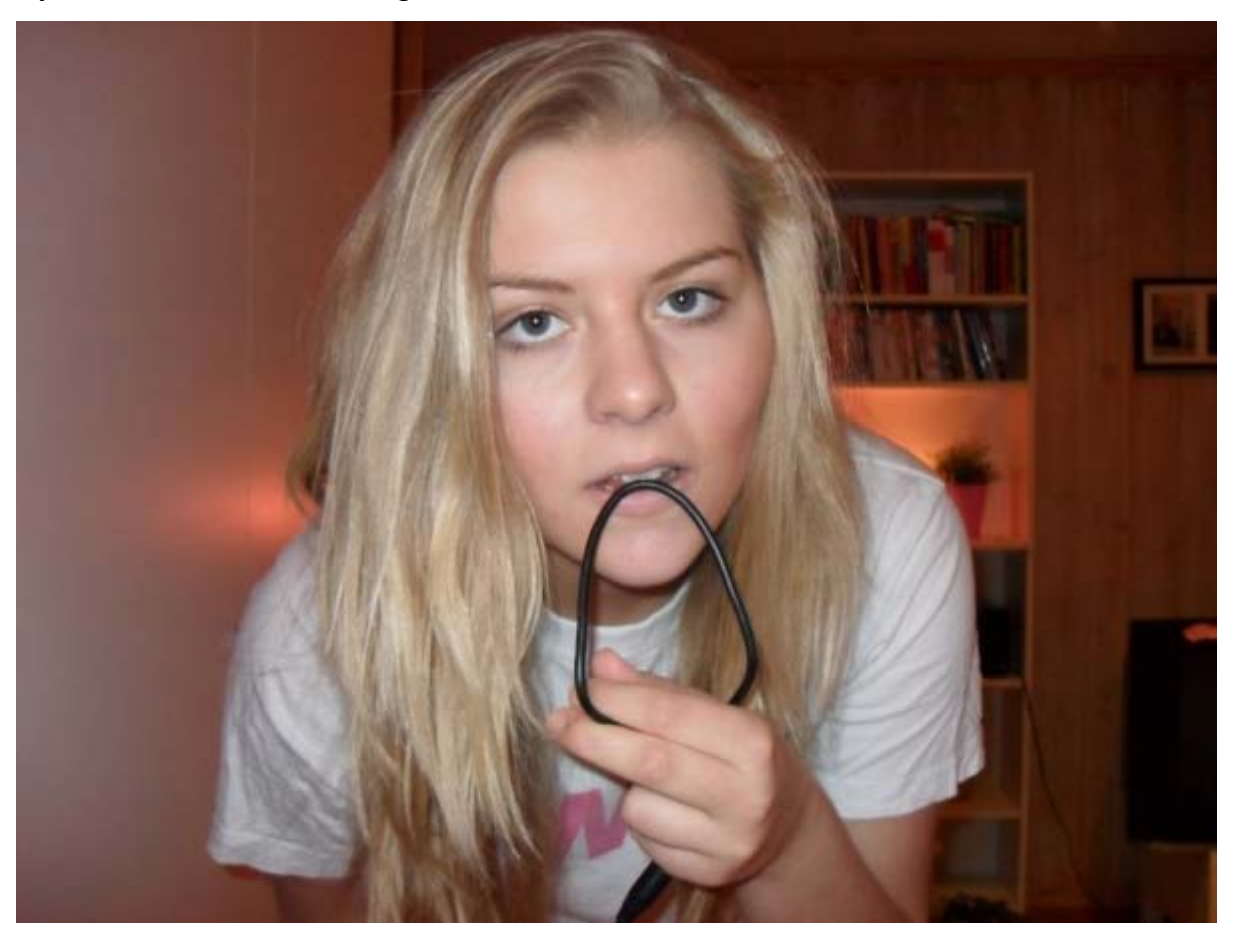
Oi, skjer'a pena? (Siljes' blog)