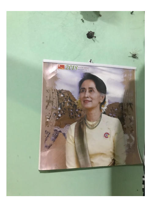
Figure 4. Two of the posters hung up in U Kyaung's monastery. Left: a monk participating in a protest by 'overturning the alms bowl.' Right: Aung San Suu Kyi.

In contrast, U Mingun's monastery is a large compound in the city suburbs, so upon entering one feels like one is leaving the city and entering a village. This monastery was bereft of visual indicators of political involvement, and when I arrived I was met by a dozen-or-so young monks kicking a football. U Mingun explained that his monastery is a meeting place for former political prisoners, and the benefits of its seclusion and privacy were apparent.