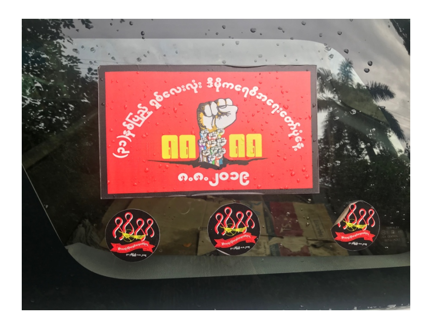
Figure 2. The logo of the 88 Uprising can still be seen around Yangon. The '8888' logo marks the most important date of the protest, 8<sup>th</sup> of August 1988.

Ne Win's rule ended with the 1988 uprisings. The protests of 1988 emerged out of mass dissatisfaction with the brutality and shortcomings of the military regime. In addition, Ne Win had demonetised between 60 and 80 percent of Burma's currency based on numerological advice (numerology is widely practiced in Myanmar) (McCarthy, 2008, p. 301). This immediately destroyed people's savings and further heightened grievances against the military. Hundreds of thousands of people took to the streets across Myanmar – largely urban students, but also villagers and monks. The leaders of the protests came to be known as the '88 Generation', many of whom are still influential figures in Myanmar today. The protests were brutally repressed and the military replaced Ne Win with the State Law and Order Restoration Council (SLORC) (1988-1997).<sup>8</sup>