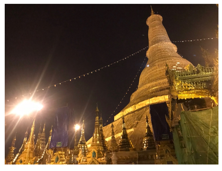
Figure 1. Shwedagon Pagoda in Yangon.