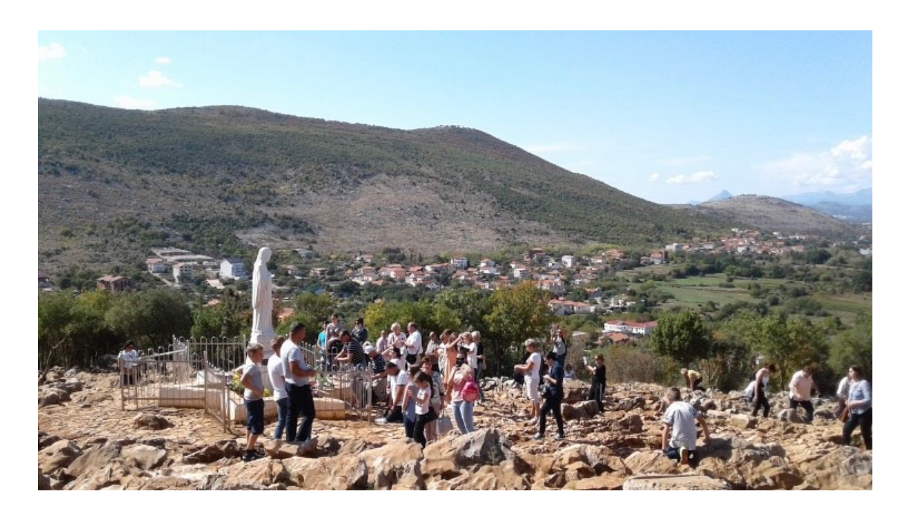
Figure 4: Statue of Mary at the top of Podbrdo

Afterwards we went up to Podbrdo, which is where the Madonna appeared. It is a rocky path, but not too difficult to travel. Some do it barefoot or on their knees. Some are unable to walk to the top, and the volunteers bring them up. However, we reached the top while praying. When you climb the mountain, you do it by praying with your group. I always had this sense of peace and sadness because I could have gone there many years before. But still this sense of tranquility and respect. I have not seen scenes of hysteria; I have only seen a lot of faith and hope with due expectations. I have also seen many young people who go, not just the elderly, who know that they have little to live for and therefore convert. I have also seen many young people. 304