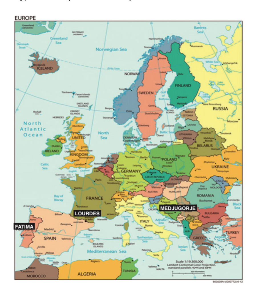
Figure 1: Map of Europe with the location of Lourdes, Fatima and Medjugorje<sup>98</sup>

even though reports of visions have increased in the last centuries.<sup>95</sup> Marian shrines attract thousands of people every year to their sanctuaries in Fatima, Lourdes and Medjugorje. The need to feel the holy generates complicated phenomena that are worthy of study and of being analyzed.<sup>96</sup> The increase in reports of miraculous events from groups of people at sanctuaries is widespread. Many pilgrims go to famous shrines such as Lourdes and Fatima to have a chance to encounter Mary, to feel her presence and help.<sup>97</sup>