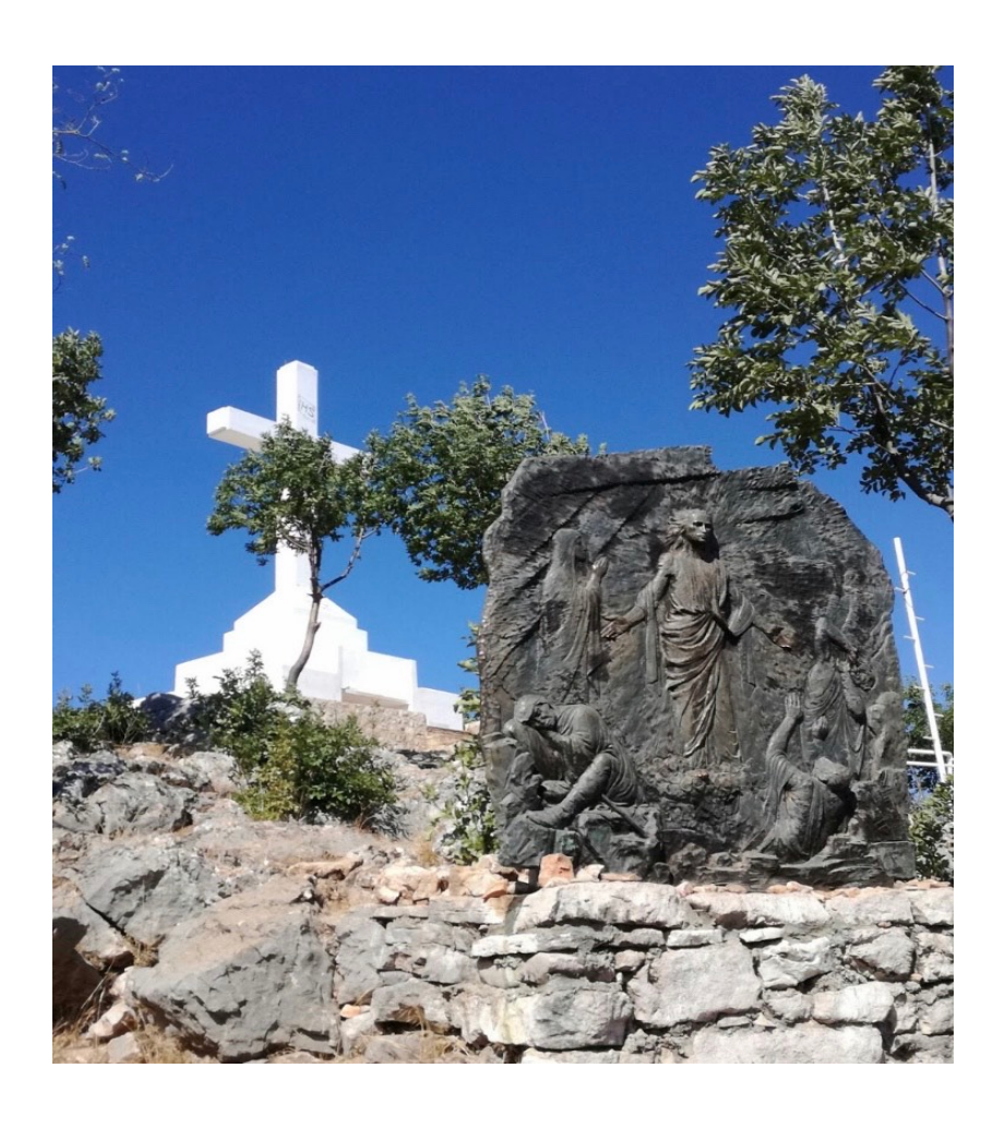
Figure 6: One of the stations at Križevac

At the top of Križevac, there is a gigantic white cross; below it is another monument showing Jesus praying in Gethsemane. It is the only bronze not depicting Mary. The sculptor of these bronzes is Carmelo Puzzolo, an Italian. The Way of the Cross is a religious practice that has a long history. In many pilgrimages since the Middle Ages, it was customary to remember and imitate the ways of the Lord.<sup>310</sup> This imitation happened thanks to the reading of the sacred scriptures, prayers and liturgy. The practice helped the pilgrim to have a closer and deeper relationship with God.