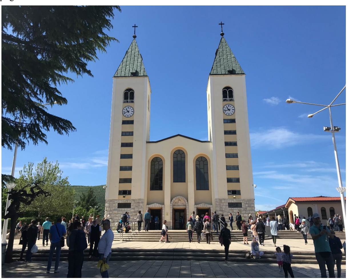
Figure 7: The Church of Saint Jacob

The opinion of the two pilgrims is clear: The Church of Saint Jacob was a plan of God. The small village has an enormous church and it is convenient for the gathering of huge crowds of pilgrims.