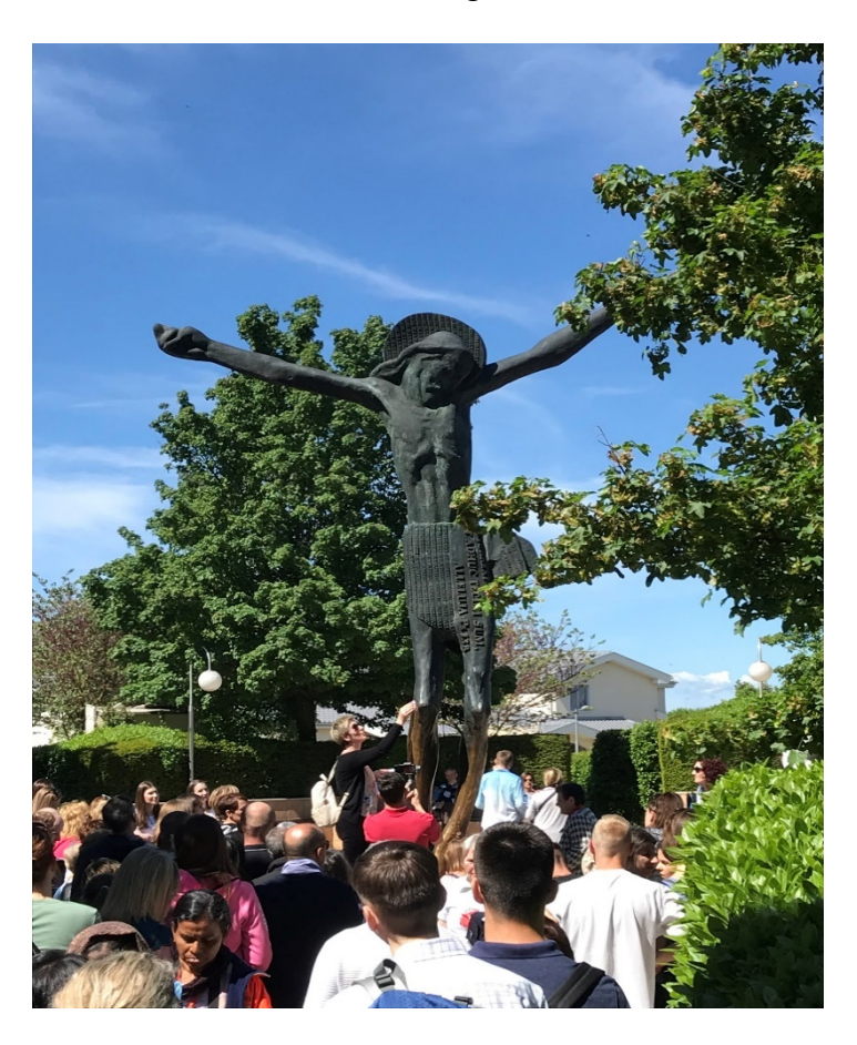
Figure 8: A Pilgrim collects the liquid from the statue of Jesus

This quote is important because it shows how this pilgrim relates to the liquid from the knees of Jesus crucified. The pilgrim does not believe that the liquid is holy, or at least, she is not sure. Her opinion does not exclude her from taking it after hours in line with other pilgrims.