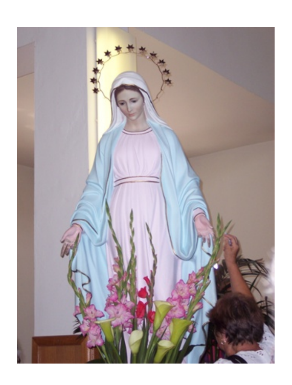
Figure 10: Statue of Mary in Tihaljina, 30 minutes from Medjugorje<sup>360</sup>

of the Immaculate Conception.<sup>356</sup> This derives from Diego Velázquez's painting Virgin of the Immaculate Conception , in 1618.<sup>357</sup> Although the dogma of the Immaculate Conception is from 1854, long is its history in Catholicism between those who supported it and those who did not. Velázquez's depiction relates to his perception of "the Apocalyptic Woman in the Book of Revelation".<sup>358</sup> After this portrait of the Virgin, later painters presented the same image of the Virgin that still persists today.<sup>359</sup>