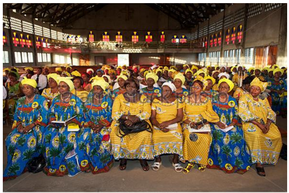
www.alamy.com - DH89RA

This Master's Thesis is submitted in partial fulfilment of the requirements for the MA degree at