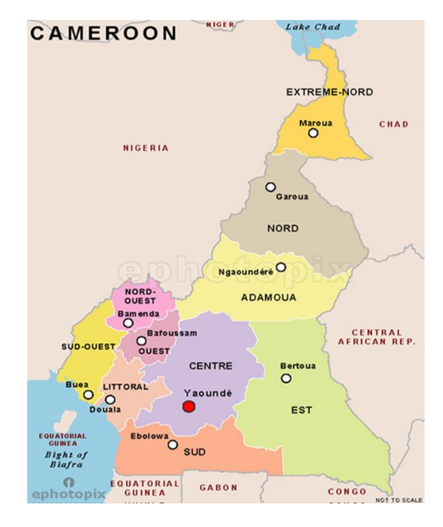
Fig.1 Map of Cameroon

There are ten regions in Cameroon and only two are English speaking – Northwest and Southwest regions. With its Bilingual nature, the French speaking Cameroonians (Francophone) occupied three-fourth (3/4) of Cameroon population (Njeuma, 1990). For administrative convenience the country has been divided into regions with each subdivided into several divisions and subdivisions (Gifford 200, p. 245 - 246).