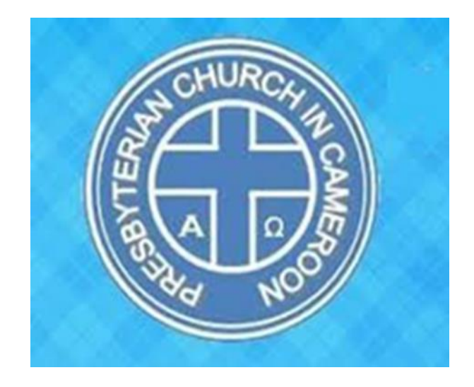
Fig.2 Presbyterian Church in Cameroon Logo

to society. On the whole, "the church is called to be the watch-man of the society" (PCC BOOK OF Orders 1995, p. 61).