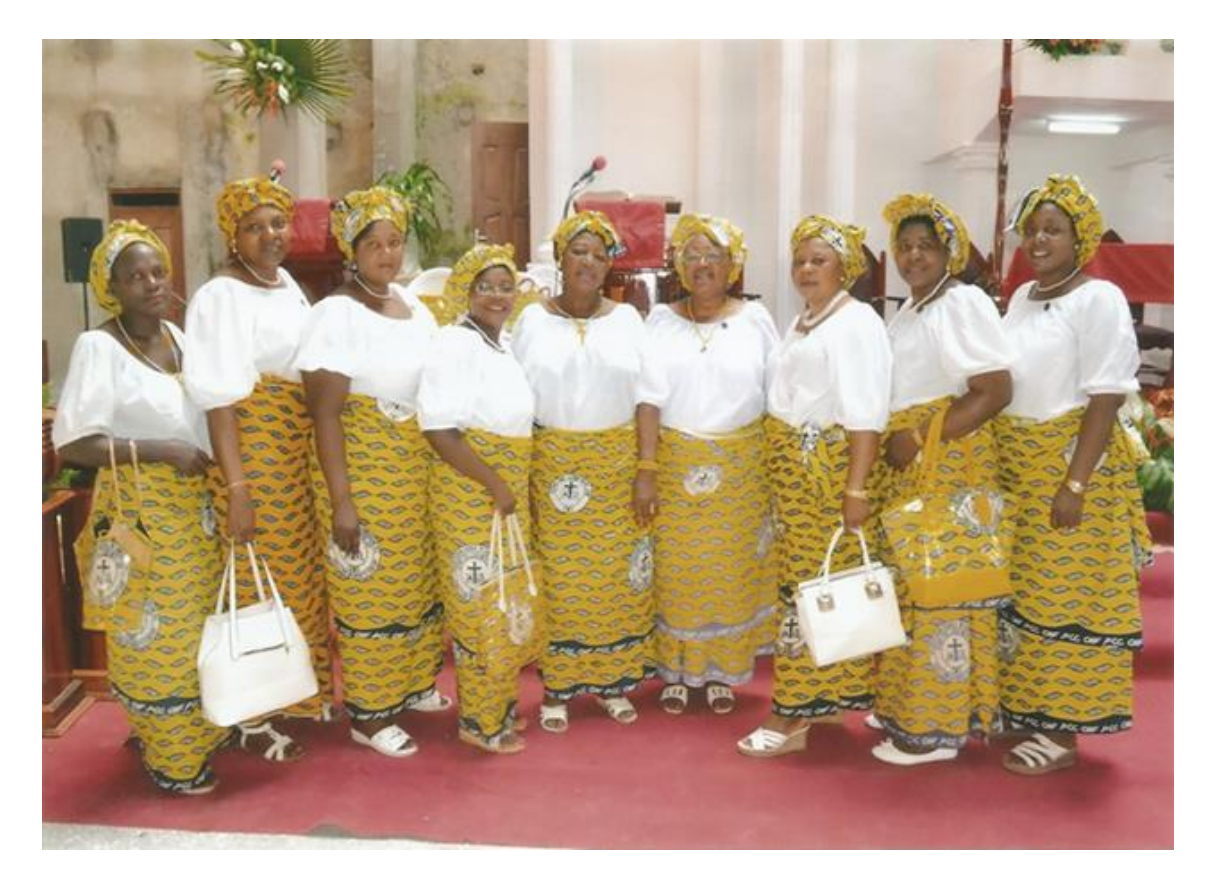
Fig.3 The Christian Women Fellowship Group, Likomba-Tiko during a church service in Limbe, Cameroon.