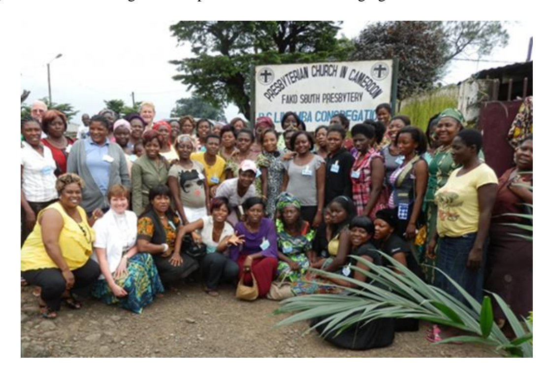
Fig. 6 Business Training Workshop at the PC Likomba Congregation