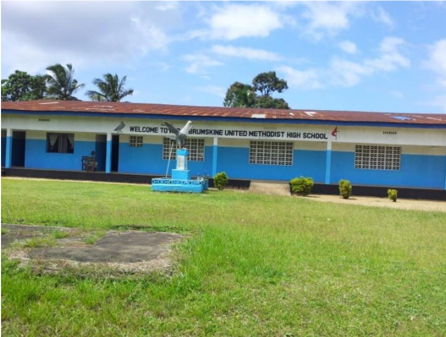
Figure 2: The W.P.L. Brumskine United Methodist High School, Old Field Buchanan City, Grand Bassa District, LAC/UMC, taken August 10, 2012

In the 2000s, the vocational programs at the school attracted most of the students as the programs were a regular part of the curriculum instead of being paid for by parents. I was also registered at the school, besides the W.P.L. Brumskine United Methodist High School that I attended.