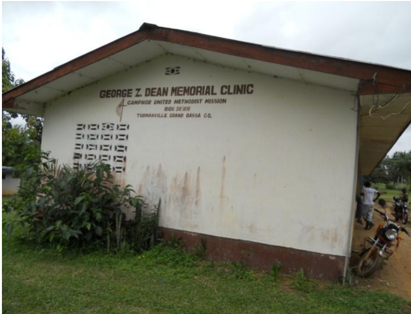
Figure 3: George Z. Dean Memorial United Methodist Clinic at the Camphor United Methodist Mission. This is first clinic built by the United Methodist Church in Grand Bassa County, Liberia.