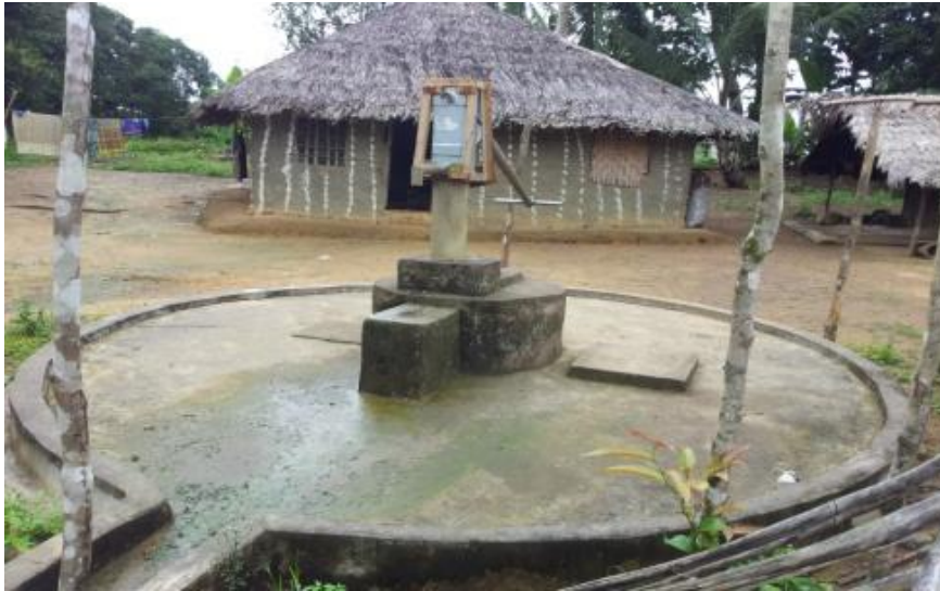
Hand Pump In District #4 Grabd Bassa County Constructed by the United Methodist Church picture taken August 7, 2012