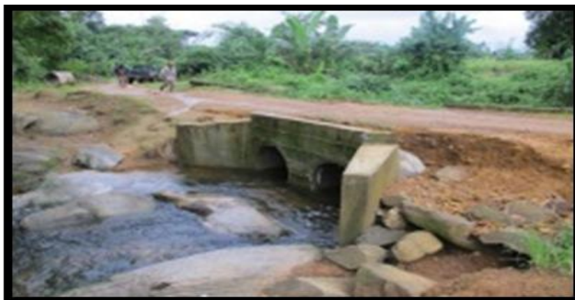
Klens Town Bridge (under construction) 215

The entire populace of the region have lined up behind The United Methodist Church with one great united force to finish this project.